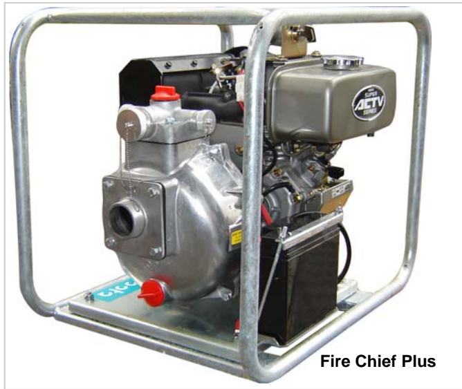
Fire Chief Plus

Model Numbers: Aussie Fire Chief Aussie "Mr T" Aussie Fire Chief Plus Aussie QP305